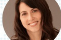
Photo from MacKenzie Scott's X account

In a milestone for economic inclusion, Upwardly Global was named among the 199 organizations that received transformative funding from MacKenzie Scott's Yield Giving, which distributed over $2 billion in 2024 to initiatives driving social change.